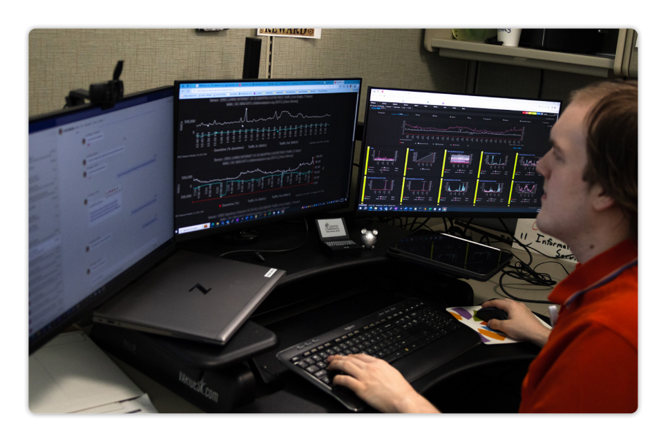
The advanced analytics and business-services-based SLA modeling and monitoring by PRTG, make all the difference to Dayton Children's Hospital.

One of the biggest differences between health care and other vertical markets is structured tiers of systems and the sheer breadth of health care IT, where more than 400 different applications can be used, and data sprawl is a challenge.